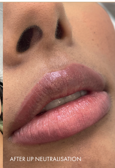
AFTER LIP NEUTRALISATION